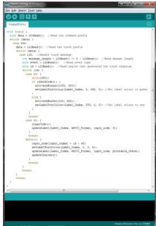
Figure 3: Keypad Example Main Loop

This simple code demonstrates the elegance that the GTT display and designer software can bring to even the most basic controllers.