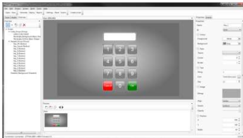
Figure 2: GTT Designer Keypad Example Design

The design for this example consists of two separate groups of elements: a keypad and a label. The keypad group consists of rectangle buttons of various colours, each assigned a specific ID. The label group contains not only a dynamic label with a set ID, but also decorative rectangles. For this example, it is important to set IDs for elements because they will be referenced directly in code. A complete list of all elements is available in the Report.txt file found within the output folder of the project.