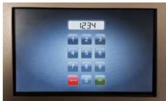
Figure 4: GTT50A running the Keypad Example

This keypad example demonstrates the power of both the Matrix Orbital GTT display series and the GTT Designer software.